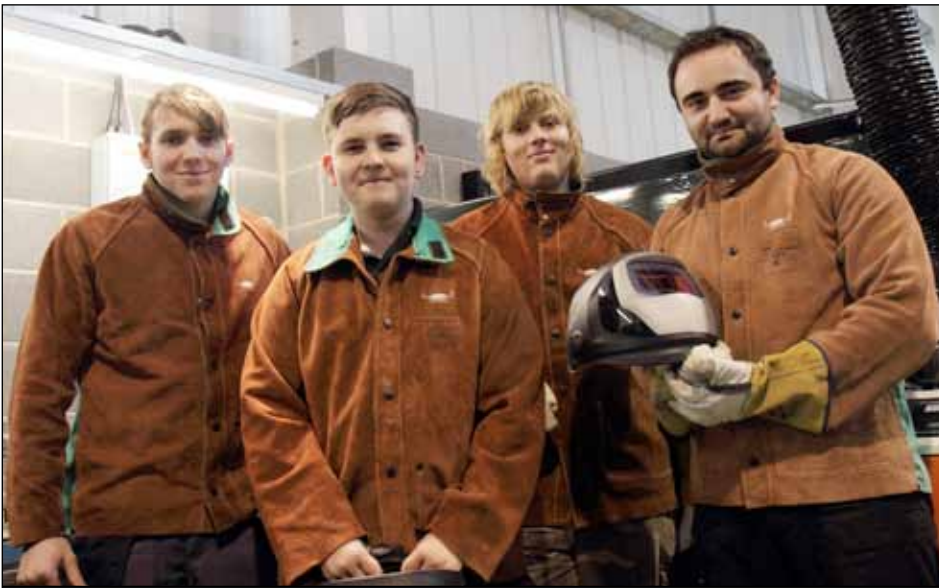
New faces: Rolls-Royce apprentices at the Nuclear AMRC interim workshop.

Four Rolls-Royce apprentices are learning at the cutting edge of the nuclear manufacturing industry with a placement at the Nuclear AMRC.