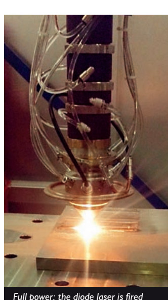
Full power: the diode laser is fired at 15kW for the first time.

The Nuclear AMRC will also investigate the diode laser's use in additive manufacturing, building on the centre's previous work with the shaped metal