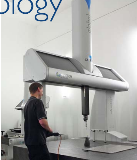
High certainty: the new Hexagon DEA Global Advantage in the Nuclear AMRC metrology lab.

The machine is being installed on 23 metre deep piles on a separate concrete plate to insulate it from vibrations from the main workshop, and will be operational from October.